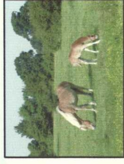
Typical views along the village walk