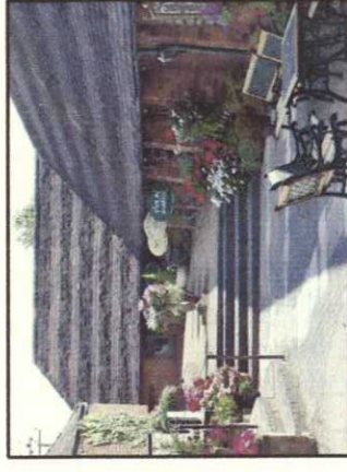
Jinney Ring Craft Centre