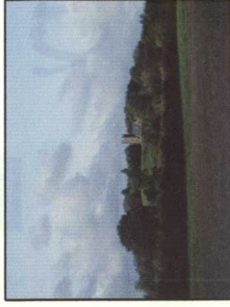
View of Hanbury Church

which is a good picnic spot and also serves food and drink.